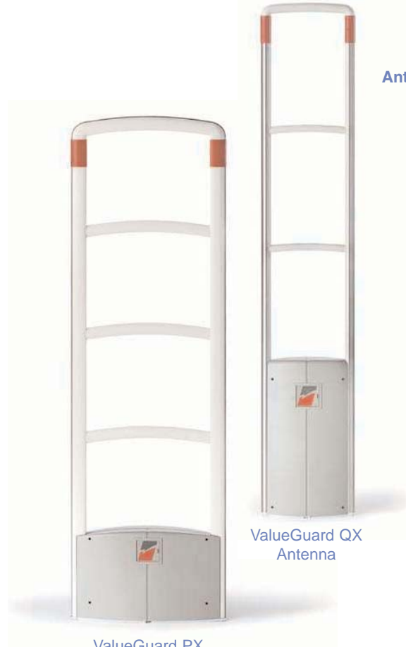
ValueGuard PX Antenna