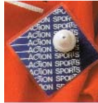
ValueGuard QX Antenna