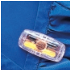
For added deterrence, ink vials are easily seen inside ChekInk II Clear tags.