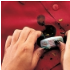
Glass vials within ChekInk II break and spill dye when tampering occurs.

With ChekInk II Tag, shoplifters are discouraged before they even attempt to steal. The tag contains sealed vials of dye that will break if forcibly removed from merchandise. The spilled dye permanently stains merchandise, rendering it unsuitable for return or re-sale. The result: significant reductions in shrinkage. The tags are constructed of durable high-impact plastic to withstand routine handling. A clear version of the tag is also available for increased deterrence.